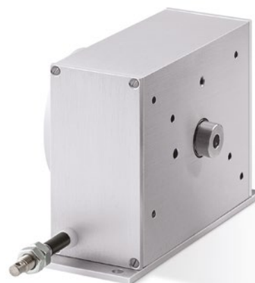
SF-I • SF-A