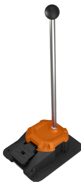
with 6050-5500-0154 Base Plate (order details see "Accessories")