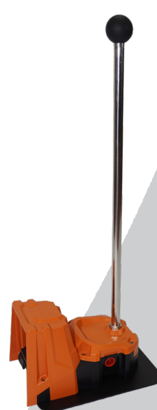
with 6050-5500-0154 Base Plate and Guard (order details see "Accessories")